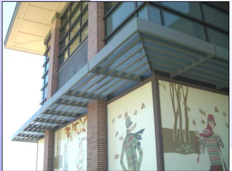
THE ORCHARD TOWN CENTER WESTMINSTER, CO