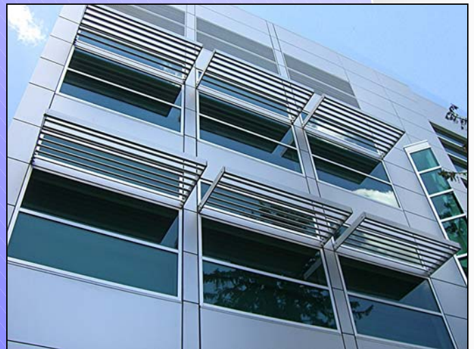
UNIVERSITY OF COLORADO HEALTH SCIENCES CENTER FITZSIMMONS FACILITY SUPPORT BUILDING AURORA, CO