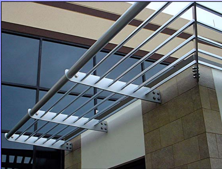
AOL / TIME WARNER CAMPUS CENTENNIAL, CO