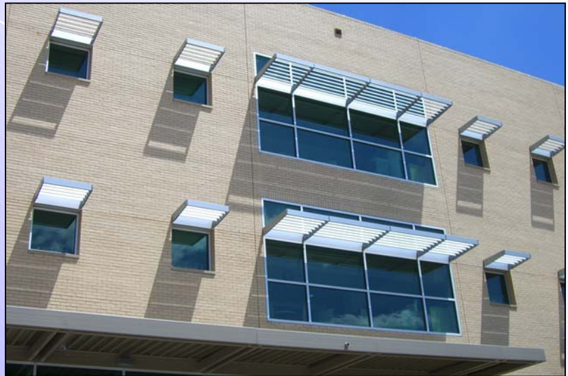
UNIVERSITY OF COLORADO HEALTH SCIENCES CENTER FITZSIMMONS FACILITY SUPPORT BUILDING AURORA, CO