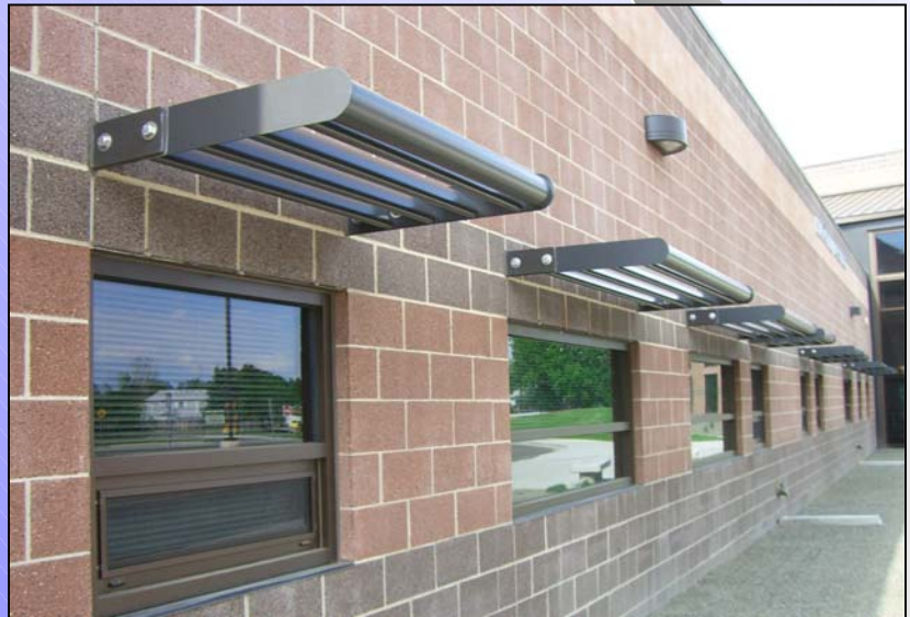
BEAR CREEK K-8 SCHOOL LAKEWOOD, CO