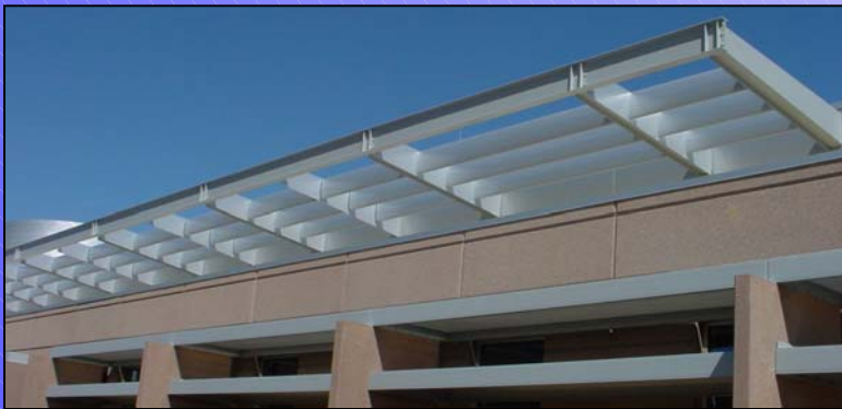
NATIONAL RENEWABLE ENERGY LABORATORY SCIENCE & TECHNOLOGY FACILITY GOLDEN, CO